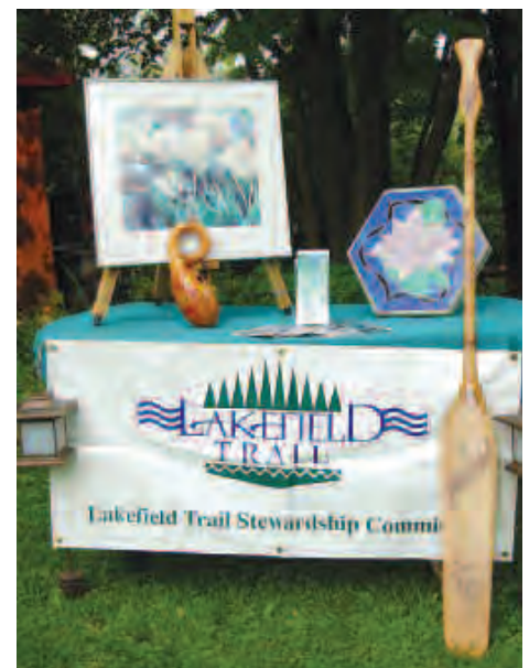
Thank you to local artists who donated their arts and crafts for last year's raffle.

This portion of the Lakefield Trail from Reid Street to the Lakefield Fire Hall has been closed, due to the construction of 50 units of affordable housing for seniors, by the Peterborough Housing Corporation. Plans include the restoration of this section of trail to its original state, once the construction project is complete.